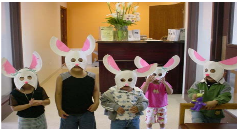
Childcare participants keeping busy making Bunny masks, April 2006